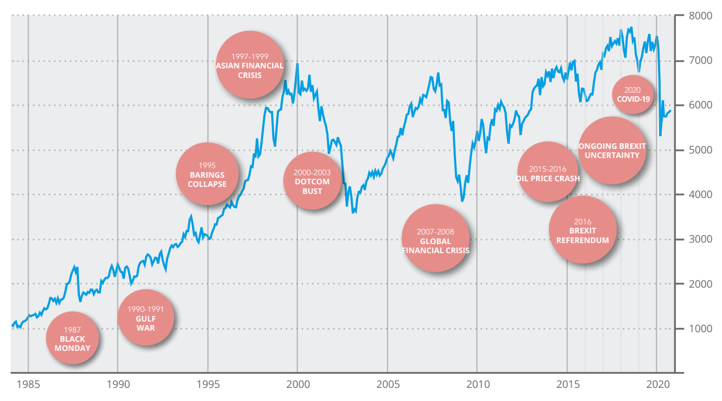
Chart: FTSE 100 since inception to 7 October 2020

As an investor, putting any short-term market volatility into historical context is useful. This chart of the FTSE 100 index since inception, details a series of significant events over the last 35 years or so. Despite a variety of market shocks and rebounds, the index still has a long-term growth trend.